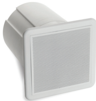
530MP with grille