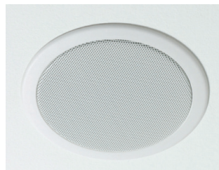
535MP shown in ceiling