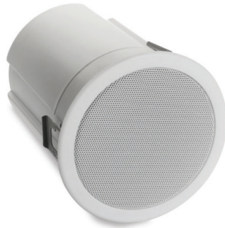
535MP with grille

You can place 500MP Series speakers in high humidity areas, like kitchens, bath, and protected outdoor settings. All exposed components are weather resistant.